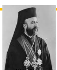
1960 AD Makarios