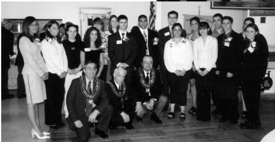
Congratulations to all the award recipients during the AHEPA awards ceremony held May 2, 2004.